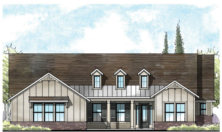
Farmhouse Elevation (Color Scheme 3)

4 Bedrooms, 3 Baths with Study and 2-Car Garage • Living Area Sq. Ft.: 3,318