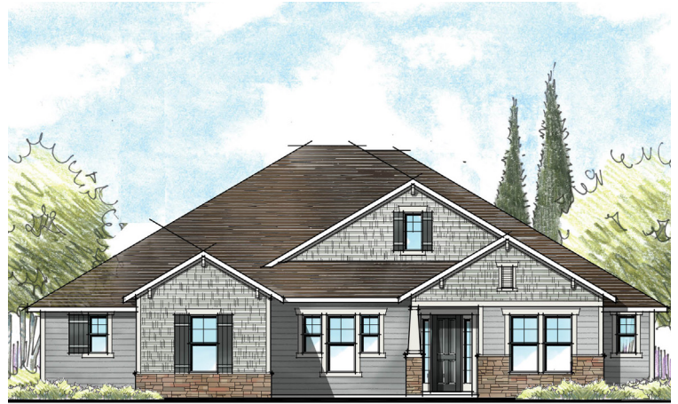
Craftsman Elevation (Color Scheme 4)